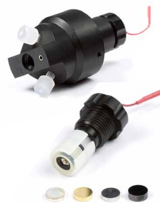
Top: Assembled FlexCell Bottom: Working electrode holder with working electrodes (from left to right): Pt, Au, MD, GC

The name FlexCell™ underlines the versatility and service-ability of this thin-layer flow cell in the Antec program. With its unrivaled design working electrodes can be serviced or replaced in a few minutes. The low cost of ownership is also attributed to the concept that different working electrode materials can be applied in the same cell. This makes the Flex-cell suitable for all sorts of electrochemical analyses like the usual biogenic amines (glassy carbon), but also carbohydrates (gold), peroxides (platinum), halides (silver), sulfides (Magic Diamond) etc.