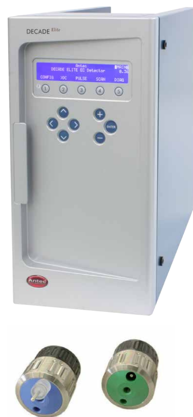
DECADE Elite available in blue or white colored housing. SenCell in front. Blue: salt bridge (Ag/AgCl), green: ISAAC (in situ Ag/AgCl) reference electrode.

The DECADE Elite has a potential range of up to \pm 2.5 V for optimal use of Magic Diamond™ (boron doped diamond) electrodes and can control up to 4 flow cells. They can be used in a parallel or serial configuration. The flow cells are known for their robustness, ease in maintenance and come with a 5 years warranty for GC electrodes. The DC mode is used for many high sensitivity applications such as neurotransmitters, vitamins, phenols, etc. The pulse mode is important for PAD (Pulsed Amperometric Detection) used in the detection of carbohydrates. The scan mode is used to obtain a voltammogram in method optimization.