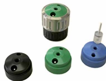
Color coded reference electrodes black: HyRef (Pd/H 2 ) green: ISAAC (in situ Ag/AgCl) blue: Salt bridge (Ag/AgCl)

The SenCell™ is a new generation electrochemical flow cell specifically designed for highest sensitivity. The tool free assembly and the continuously adjustable working volume guarantee ease of use and fast noise stabilization. The volume of the cell can be adjusted between 0 and 300 nL.