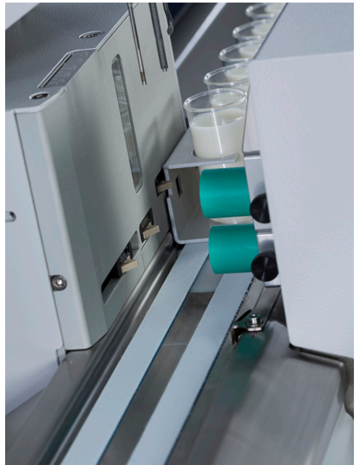
Up to 600 samples per hour handled with minimal cleaning and maintenance work

The sample ID system supplied with the CombiFoss 7 is designed to make the job of controlling samples and sample data as simple as possible. It supports both barcode and RFID sample identification concepts. A modular design ensures ease of cleaning and maintenance including a sample conveyor that does not require use of compressed air. An intelligent pipette system improves safety by detecting closed lids on samples bottles.